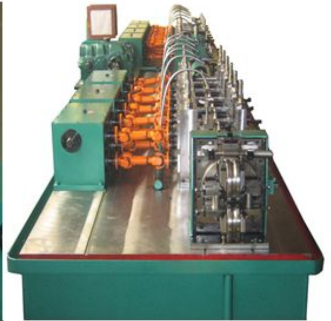
Those are about main roll forming parts.