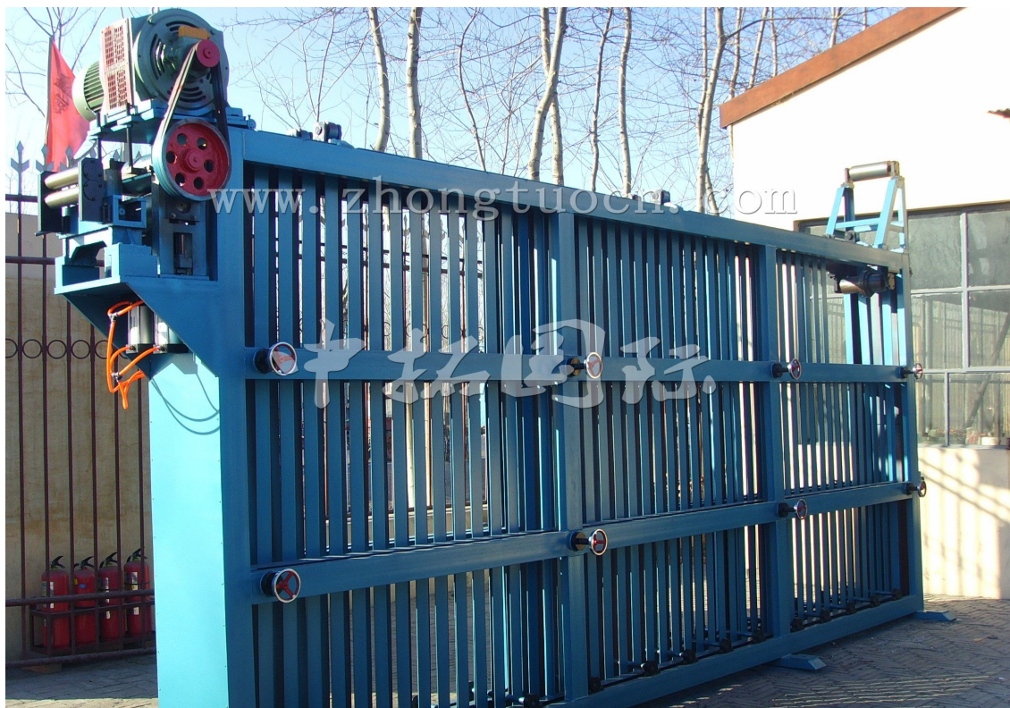
Electrical storage warehouse.