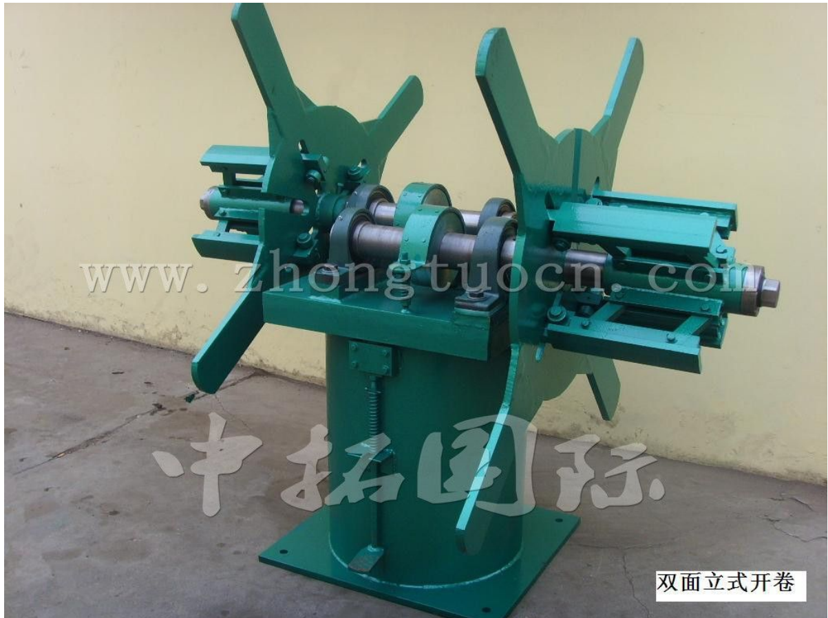
Double head decoiler for stocking more coil.