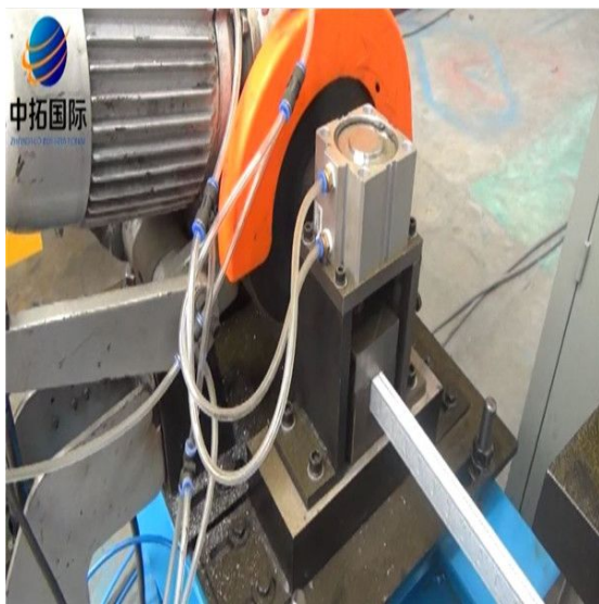
This is about the shearing part, track flying cutting saw.